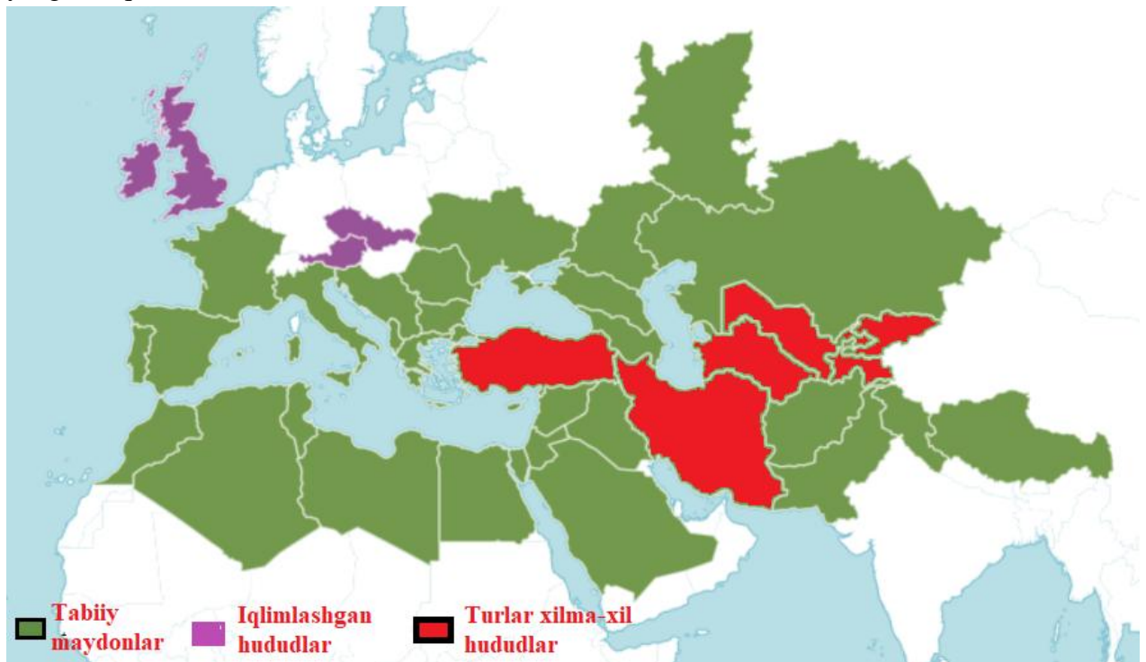
1-Rasm. Phlomis turkumi tarqalishi bo'yicha geografik ko'rsatkichlar

bo'yicha dala tadqiqotlarini olib borish va molekulyar tahlillarini amalga oshirish bo'yicha yangicha qarashlarni talab etadi [5].